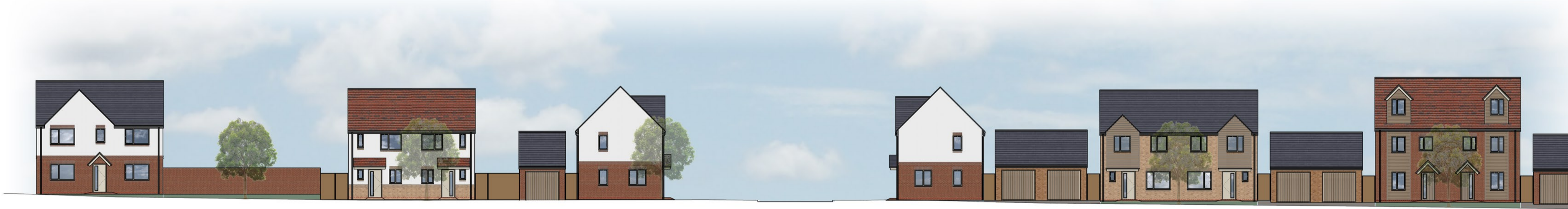
STREET SCENE B-B