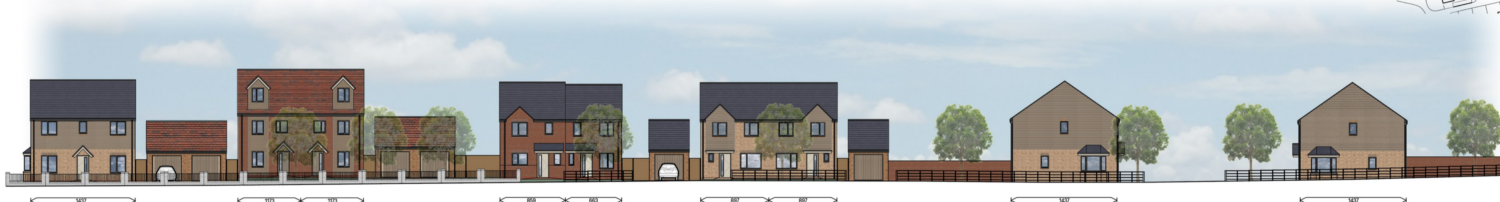
STREET SCENE C-C PART 1