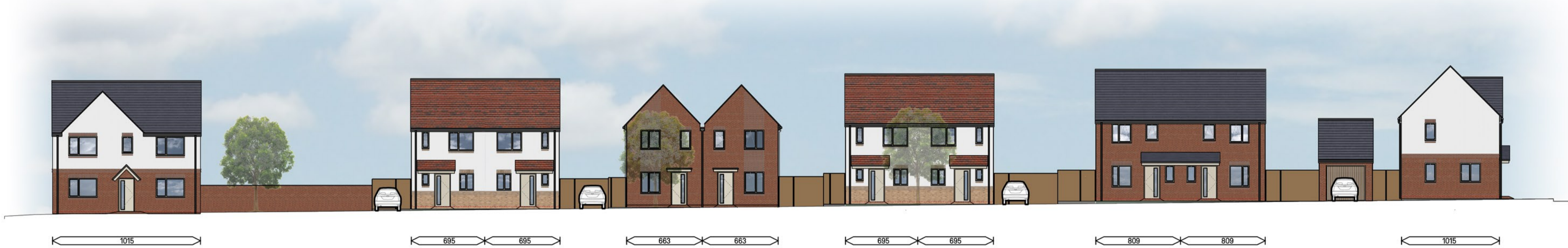
STREET SCENE A-A