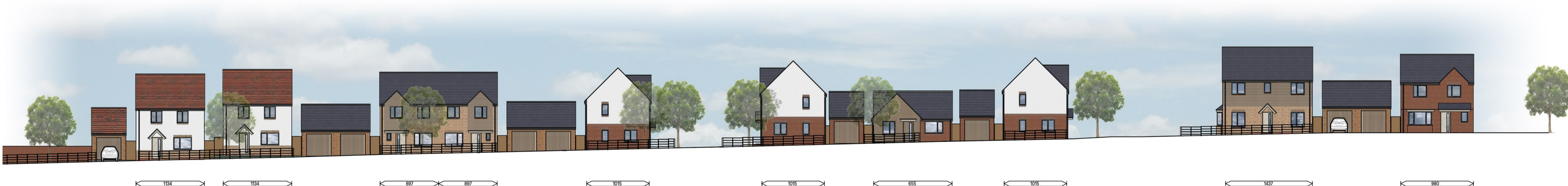
STREET SCENE C-C PART 2